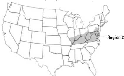
REGION 2 (Maximum Rate 3 pints per acre, alternate years)

REGION 2 - Includes the following states or portion of states where VISE may be applied: Delaware, Kentucky, Maryland, Virginia, West Virginia, south of Interstate 70 in the following states: Illinois, Indiana and Ohio and all areas south of Interstate 80 to the intersection of U.S. Highway 15 and east of U.S. Highway 15 and U.S. Highway 522 in Pennsylvania.